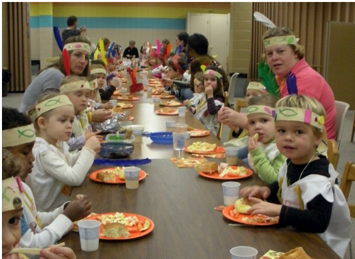
Us Indians enjoyed our Thanksgiving Feast!

Thank You for supporting Mom's Day Out's Fall Outreach!