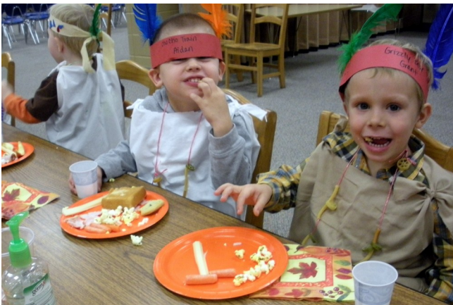
Us Indians enjoyed our Thanksgiving Feast!