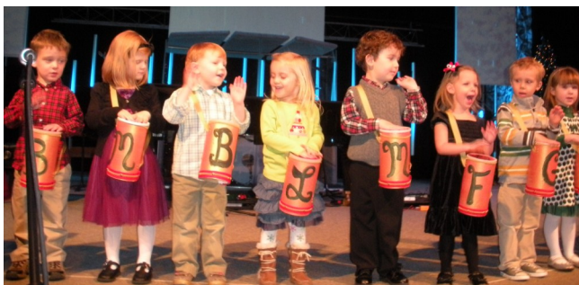
The Giraffe class practice for our Christmas Program!

right way. I hope you are trusting in God with your New Year!