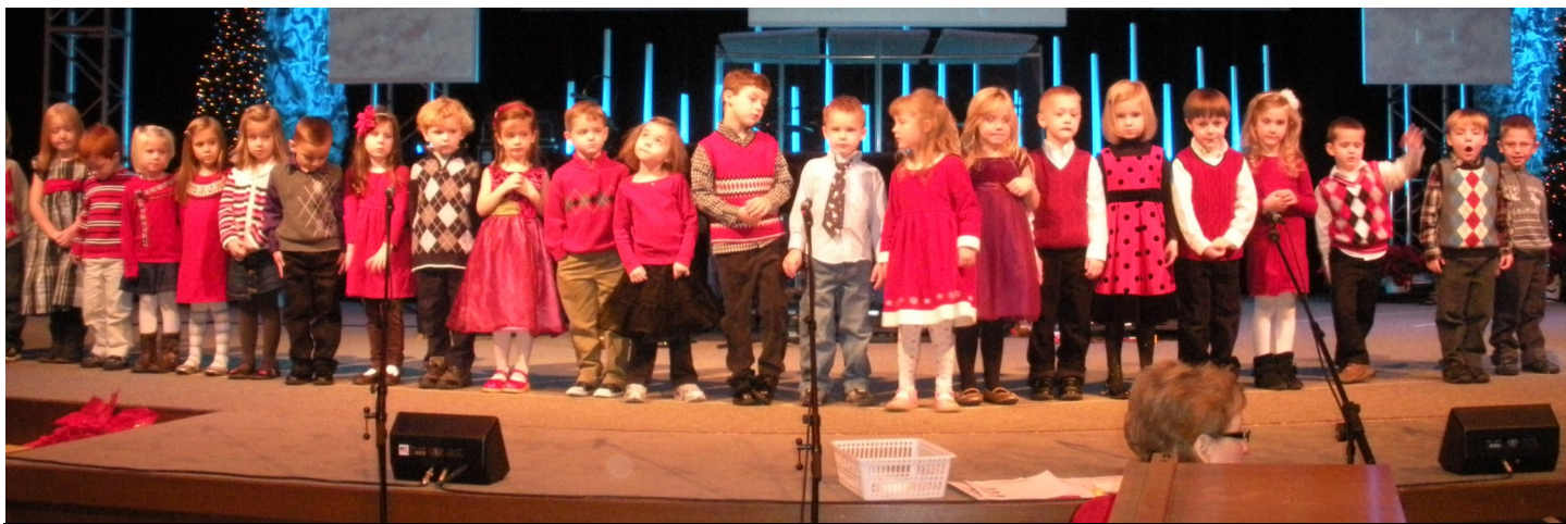
The Marvelous Mice Class practice for our Christmas Program!

Our Bible stories this month will be about the life of Jesus beginning with him growing up in Nazareth. As we learn the "Months of the Year" song, ask your child to sing it at home!! There will be more emphasis in counting and numbers. We will also begin learning the Pledge of Allegiance. The letters of the alphabet will continue - a letter every week. Be sure to watch your calendar. Also, beginning this month we will start to learn some basic vocabulary words in Spanish. We hope to have another fun filled month!